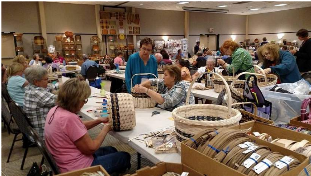
Busy weavers at the 2015 Weaving Odyssey