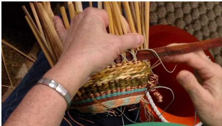
Weaving with naturals during Judith Saunders' class.