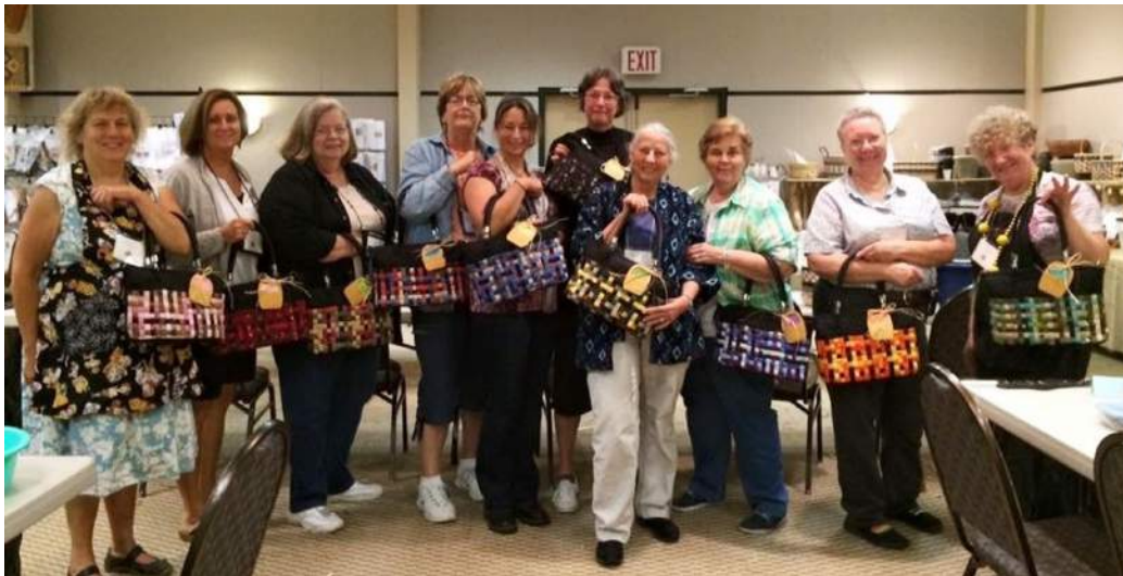
Weaving Odyssey instructors love their teacher gifts: handmade purses!